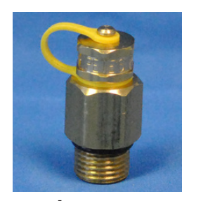
Product: #572 Core: Nordel with Buna-N O-Ring Sealant Buna-N O-Ring Sealant Thread: 9/16" NFT Length: 1 1/2"