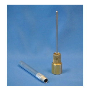
Product: #500XL Brass Gauge Adapter with 1/8" Probe for XL Plugs