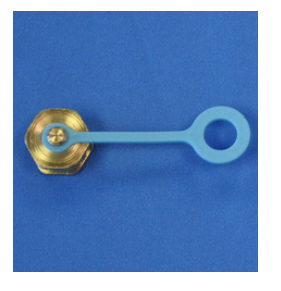
Product: #104-1BS Cap Assembly with a Black Neoprene Gasket & Blue Strap