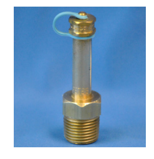
Product: #700XL Core: Neoprene Thread: 1/2" NPT Length: 3"