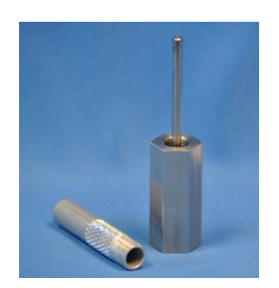
Product: #520 Stainless Steel Gauge Adapter with 1/8" Probe