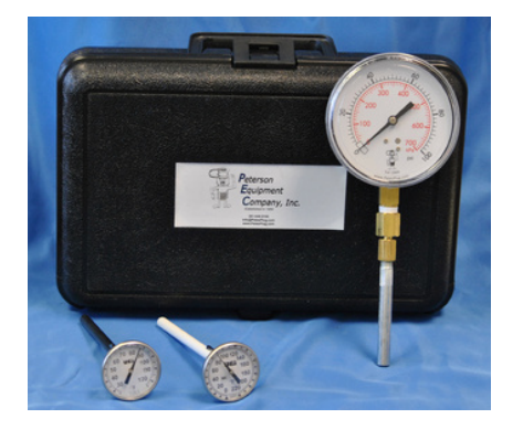
Product: #1500XL 0-100psi for XL Pete's Plugs® Included in Kit: