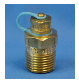
Product: #700 Core: Neoprene Thread: 1/2" NPT Length: 1 1/2"