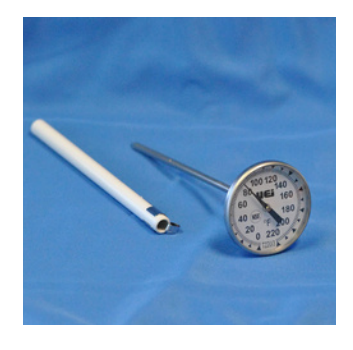
Product: #603 0 to 220 Degrees Fahrenheit with a 1 3/4" Dial Face Stem Diameter: .156"