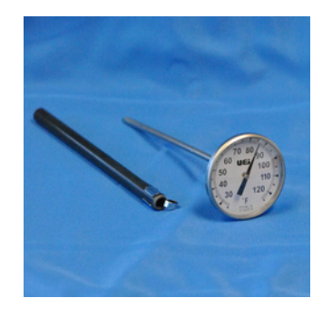
Product: #601 25 to 125 Degrees Fahrenheit with a 1 3/4" Dial Face. Stem Diameter: .156"