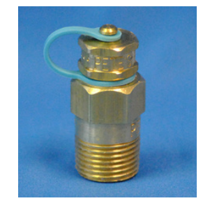
Product: #300 Core: Neoprene Thread: 3/8" NPT Length: 1 1/2"