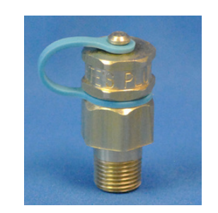
Product: #12500 Core: Neoprene Thread: 1/8" NPT Length: 1 1/4"