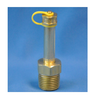
Product: #710XL Core: Nordel Thread: 1/2" NPT Length: 3"