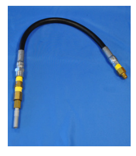
Product: #1600S Oiler Spout Hose Only