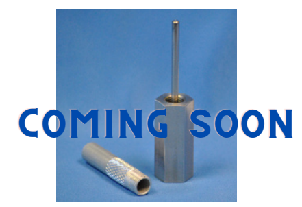
Product: #520XL Stainless Steel Gauge Adapter with 1/8" Probe for XL Stainless Steel Plugs