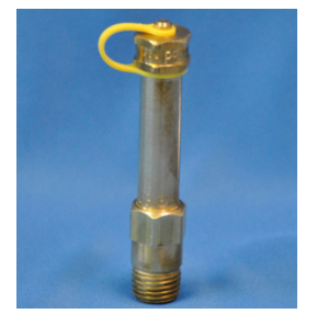
Product: #110XL Core: Nordel Thread: 1/4" NPT Length: 3"