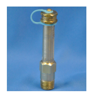
Product: #100XL Core: Neoprene Thread: 1/4" NPT Length: 3"