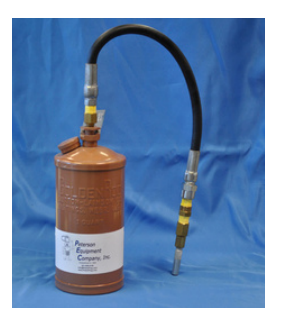
Product: #1600 One Quart Oiler and Spout plus Hose Assembly