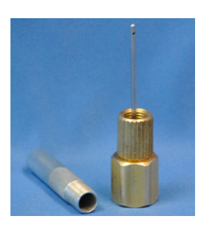
Product: #510 Brass Gauge Adapter with 1/16" Probe