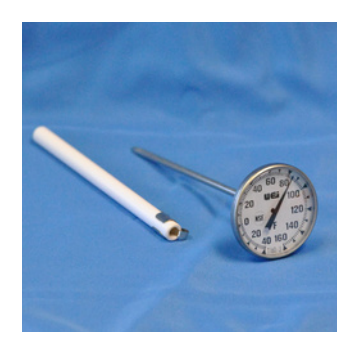
Product: #600 -40 to 160 Degrees Fahrenheit with a 1 3/4" Dial Face Stem Diameter: .156"