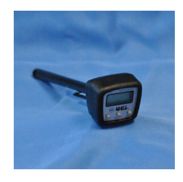
Product: #606 -58 to 550 Degrees Fahrenheit with a Digital Display Stem Diameter: 156"