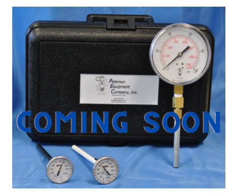
Product: #1400 Stainless Steel 0-100psi