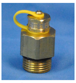
Product: #760 Core: Nordel with Buna-N O-Ring Sealant Thread: 3/4" - 16 NFT Length: 1 1/2"