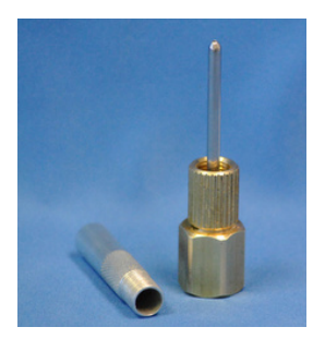
Product: #500 Brass Gauge Adapter with 1/8" Probe