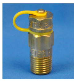
Product: #110 Core: Nordel Thread: 1/4" NPT Length: 1 1/2"