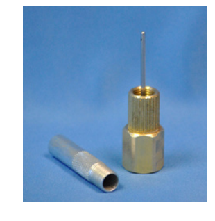
Product: #510S Brass Gauge Adapter with 1/16" Probe