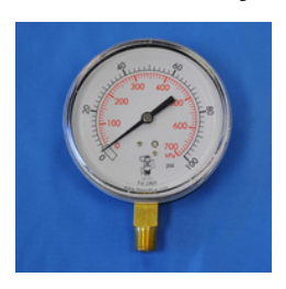
0 - 100 PSI