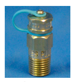
Product: #100 Core: Neoprene Thread: 1/4" NPT Length: 1 1/2"