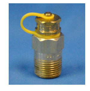
Product: #310 Core: Nordel Thread: 3/8" NPT Length: 1 1/2"