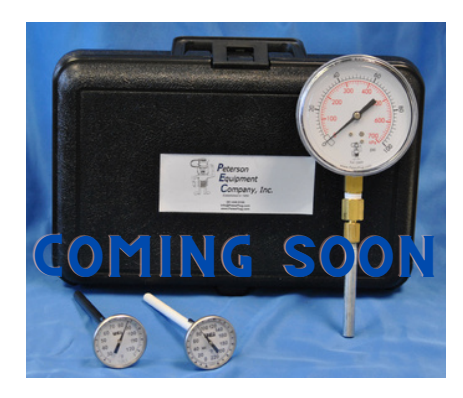
Product: #1500 BSP 0-100psi Included in Kit: