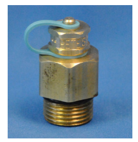
Product: #750 Core: Neoprene with Thread: 3/4" - 16 NFT Length: 1 1/2"