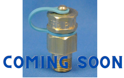
Product: #12510 Core: Nordel Thread: 1/8" NPT Length: 1 1/4"