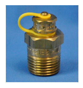
Product: #710 Core: Nordel Thread: 1/2" NPT Length: 1 1/2"