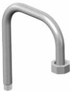
DOUBLE 90° LOOP