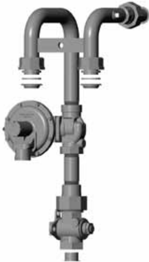
METER SET WITH PRE-BENT LOOPS

Residential meter sets are available in many sizes and configurations, Georg Fischer Central Plastics can customize to meet your specifications.