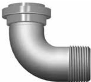
INSULATED 90° ELBOWS