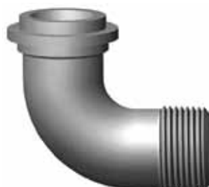
NON-INSULATED 90° ELBOWS