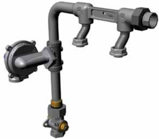
METER SET WITH METER BARS