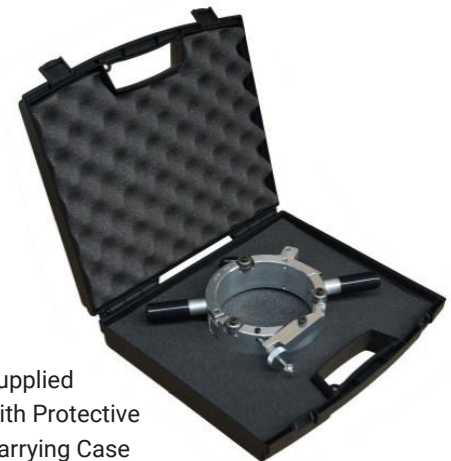
Supplied with Protective Carrying Case