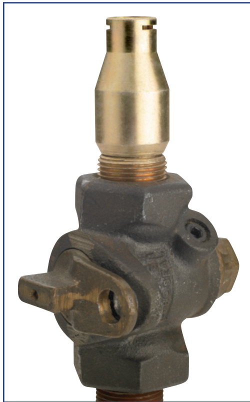
Typical Lock Plug Installation