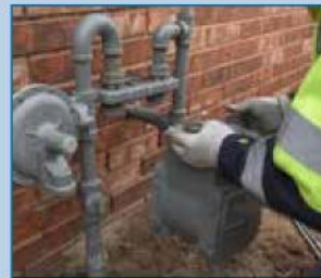
3 Remove the old meter