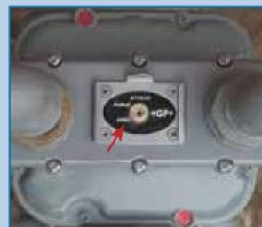
7 Turn the Co-Pilot key to OPEN