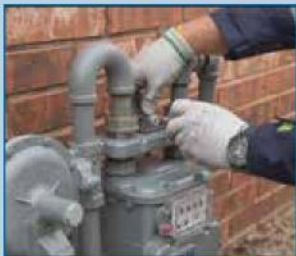
1 Unlock the Co-Pilot