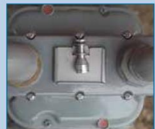
8 Lock the security cover plate