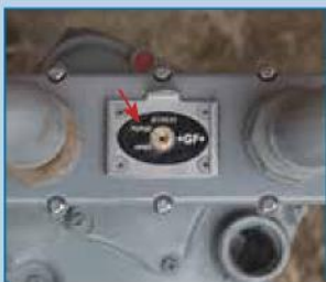
5 Turn the Co-Pilot to PURGE