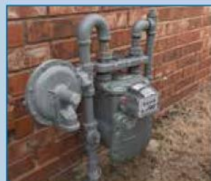
6 Connect the outlet side of the new meter