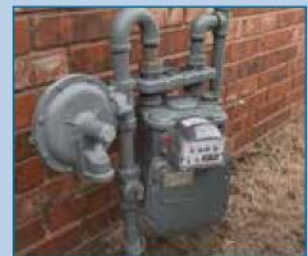
4 Connect the inlet side of the new meter