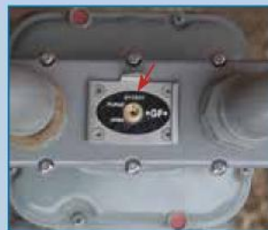
2 Turn the Co-Pilot to BY-PASS