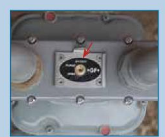
2 Turn the Co-Pilot to BY-PASS