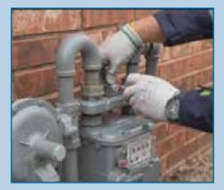
1 Unlock the Co-Pilot