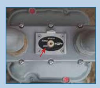
7 Turn the Co-Pilot key to OPEN