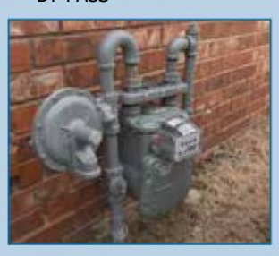
6 Connect the outlet side of the new meter