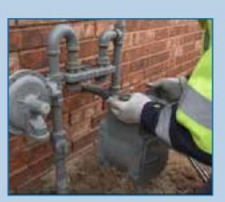
3 Remove the old meter