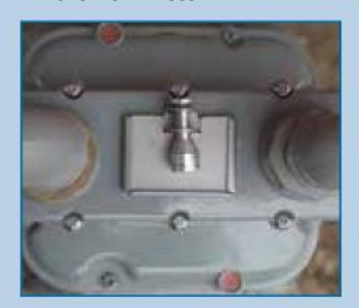
8 Lock the security cover plate