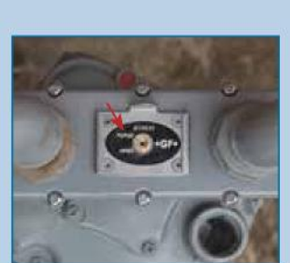
5 Turn the Co-Pilot to PURGE