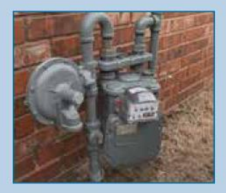
4 Connect the inlet side of the new meter