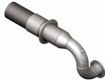
12" x 8" TRANSITION