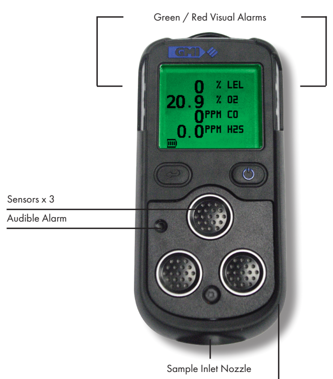
Charging and communication port (at the back)