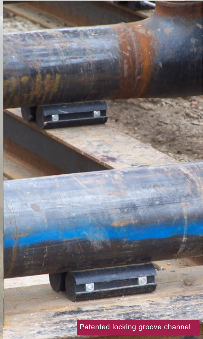
Patented locking groove channel