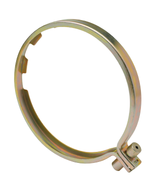
AMLR CARBON STEEL