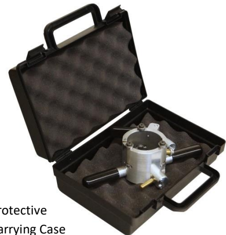
Protective Carrying Case